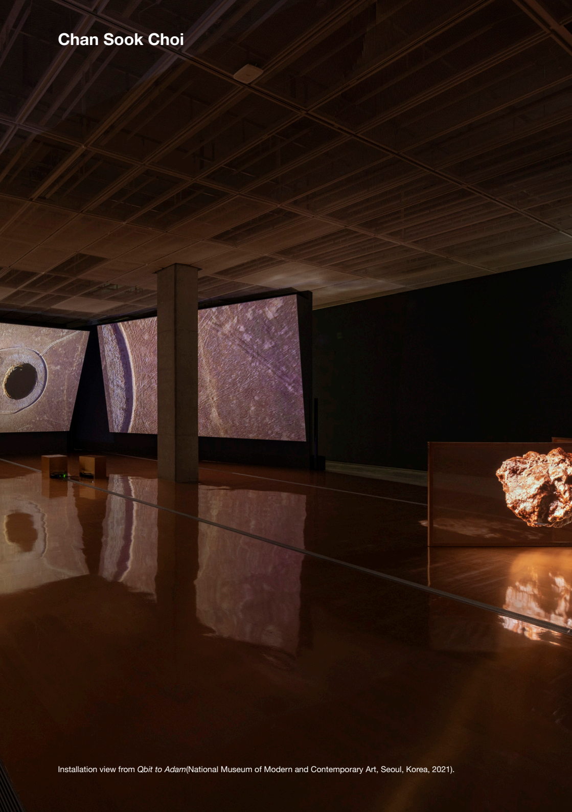
Installation view from Qbit to Adam (National Museum of Modern and Contemporary Art, Seoul, Korea, 2021).