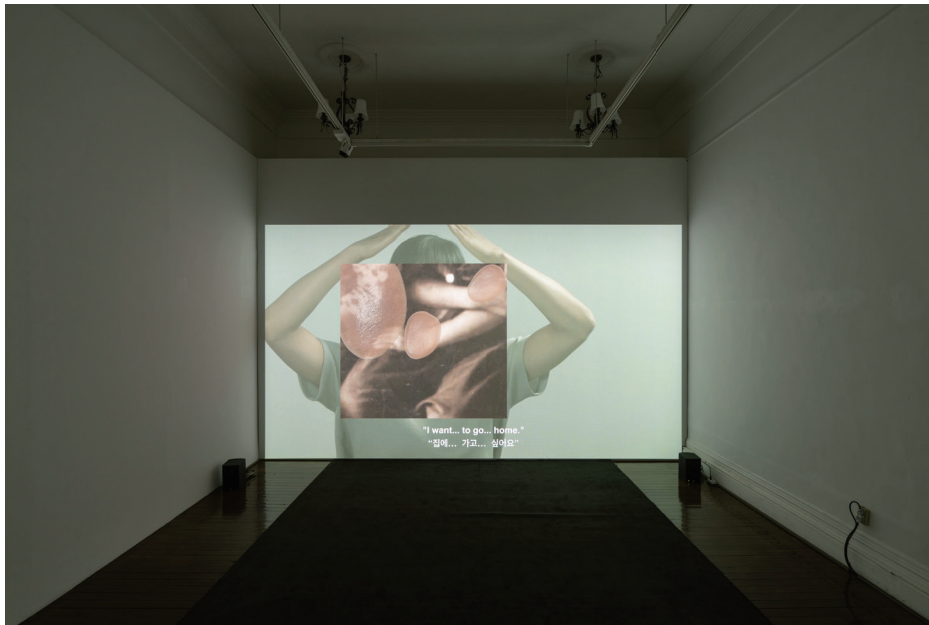
Installation view of Mykyrina from Signaling Perimeters (Nam-seoul Museum of Art, Seoul, Korea, 2021).